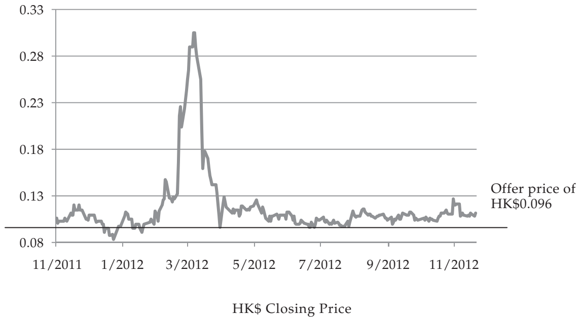
Chart A – Closing Price of PNG Share during the Review Period

We have reviewed the movements in the closing prices of PNG Shares for the period commencing from 1 November 2011 (being the first trading day of the month falling 12-month period prior to the Last Trading Date) up to the Latest Practicable Date (the “ Review Period ”). We are of the view that the Review Period being around 12-month period prior to and including the Last Trading Date would provide us with the most recent market information of PNG Shares. The closing prices of PNG Shares during the Review Period are set out below: